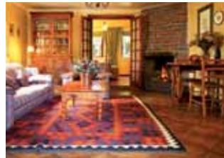
Oak Tree Cottage