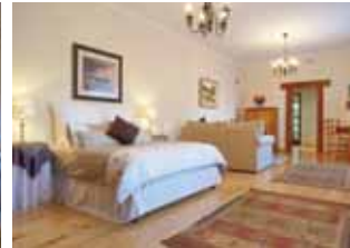
Clydesdale Luxury Suite